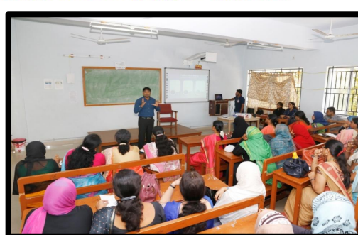
Resource persons from different disciplines on Curriculum Design